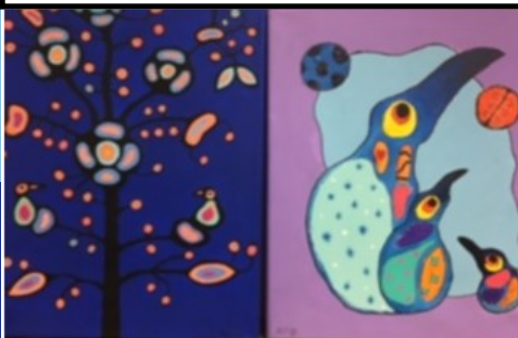
Flowers and Birds by Sarah Z.